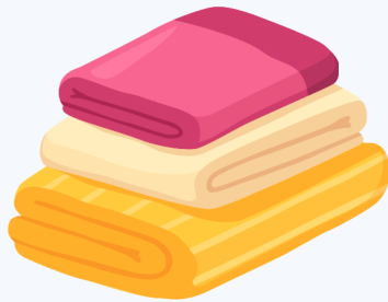
Towels and blankets