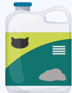
Non-clumping cat litter