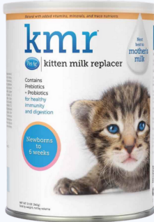
KMR Kitten formula