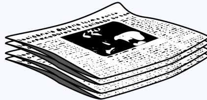
Newspaper or puppy pads to line your floor