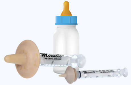
Bottle, syringe, and a variety of nipple attachments