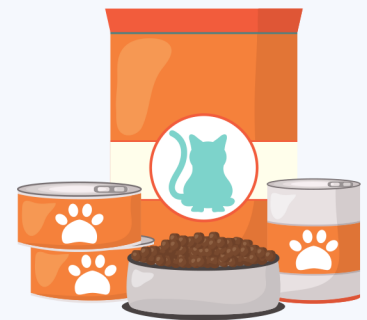
Kitten food (once old enough to transition from KMR)