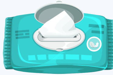
Baby or pet wipes